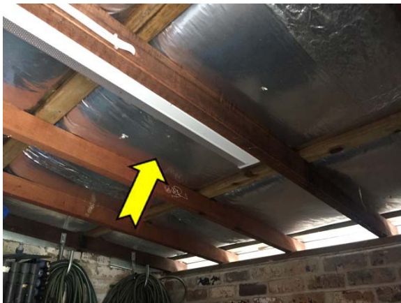
Photo 3. Interior, store room, ceiling – suspected SMF sarking insulation material.