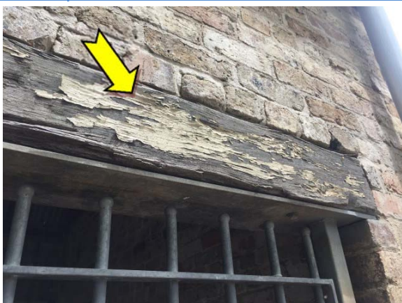
Photo 5. Exterior, trusses to stable gates, wooden lintel – suspected lead-containing beige upper paint systems.