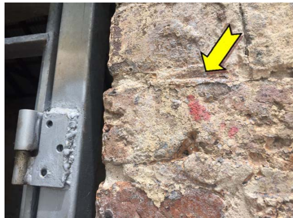
Photo 4. Exterior, throughout, walls – lead-containing brown lower coloured paint system.