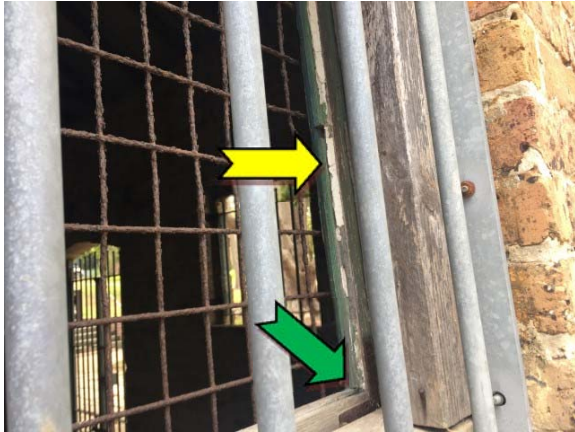
Photo 1. Exterior, north-east elevation, window frames – non asbestos-containing window caulking and suspected lead-containing green upper paint systems.