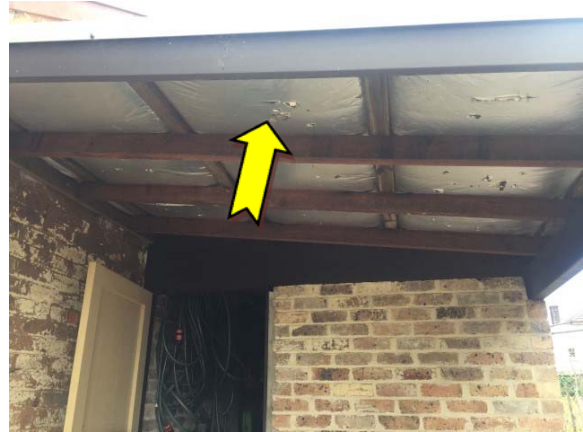
Photo 2. Exterior, west elevation, awning – suspected SMF sarking insulation material.